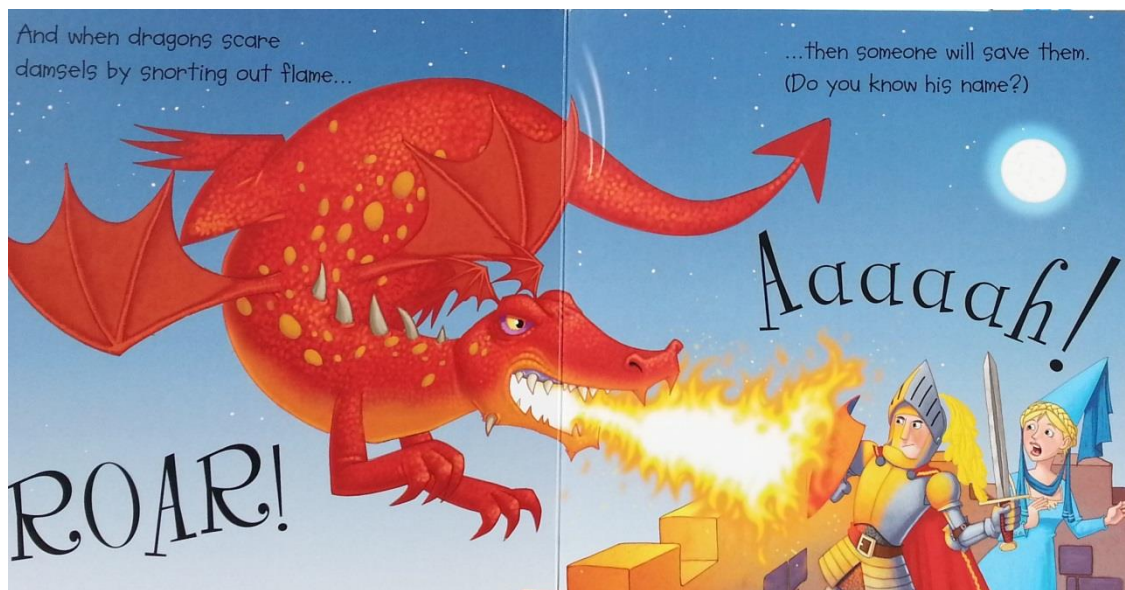
Figure 1. Noisy Knights (Taplin, 2010, P. 5-6) invites young male readers to identify with a ‘damsel-saving’ knight

Regarding younger children, a search for chivalry and related terms such as “knight” “damsel in distress” and “princess” in the children’s section of Amazon Books website (for ages 2–12) generated over 10,000 results, revealing that a fascination with medieval gender roles remains popular with children and their parents today, a result that can be multiplied with the addition of teenage and adult books in the same genre (Amazon, 2018). One example titled Noisy Knights (for boys aged 2–5) shows pictures of a distressed damsel menaced by a fire-breathing dragon (the book includes a battery operated button to make her scream in audio) (Taplin, 2010). The text asks the reader if he knows of any knight who might be brave enough to save her, a question clearly designed to lead young male reader to volunteer service, imagining himself stepping into a position of danger to protect the damsel and reduce her distress.